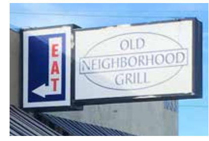
... who could possibly find fault with a place that features a sign pointing to the door that says "EAT"!

Old Neighborhood Grill • 1633 Park Place Ave. 817-923-2282 • https://ongwebsite.godaddysites.com/